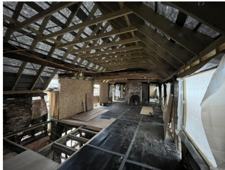
The first floor activity space