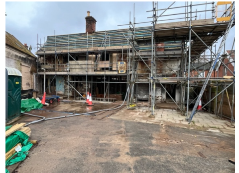
The rear of the building cleared for foundation works